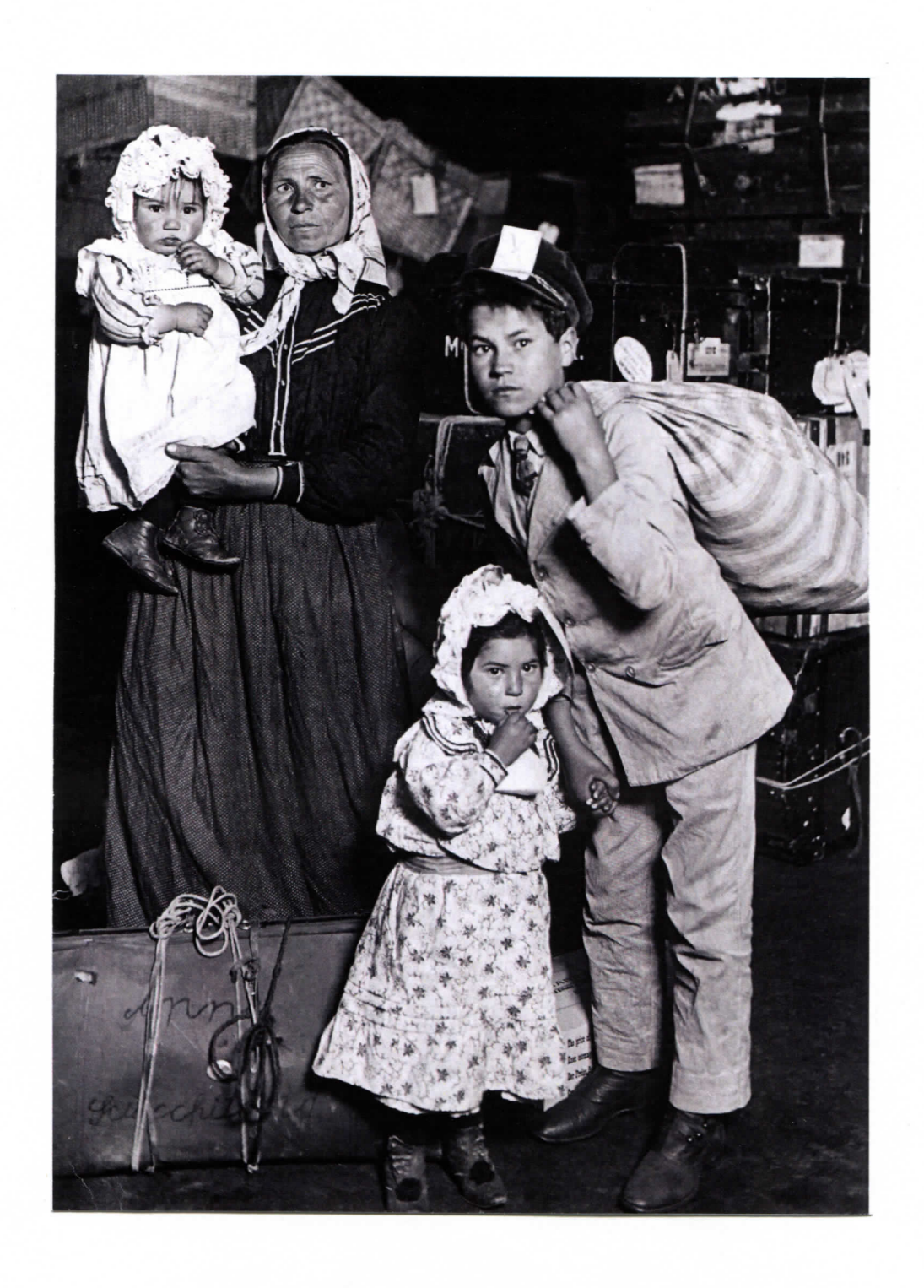
An Immigrant Family Arrives in New York City in 1905