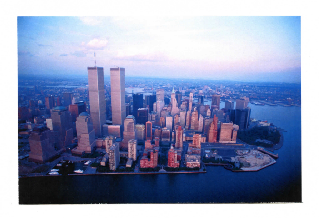
The Port Authority of New York and New Jersey Protected the World Trade Center