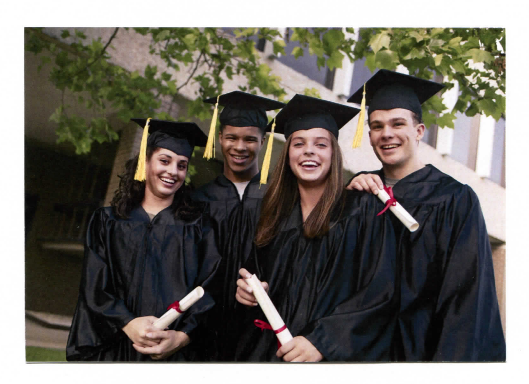
In America, everyone has the chance to dream