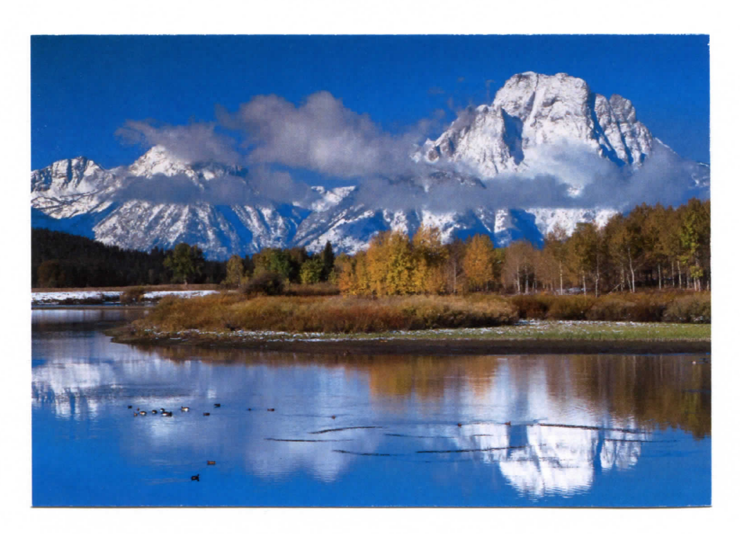
The Grand Teton Mountains in Wyoming